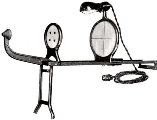
M611 Axis Marker