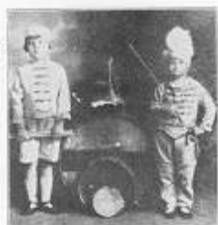
TRAP DRUMMER AND BEEM MAJOR

Including numerous return engagements, to their credit in Los Angeles, Pasadena, Hollywood, Oakland, San Francisco, Berk- eley, etc.