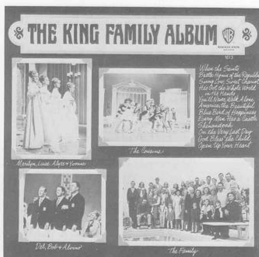
THE KING FAMILY ALBUM WARNER BROS. ALBUM #1613