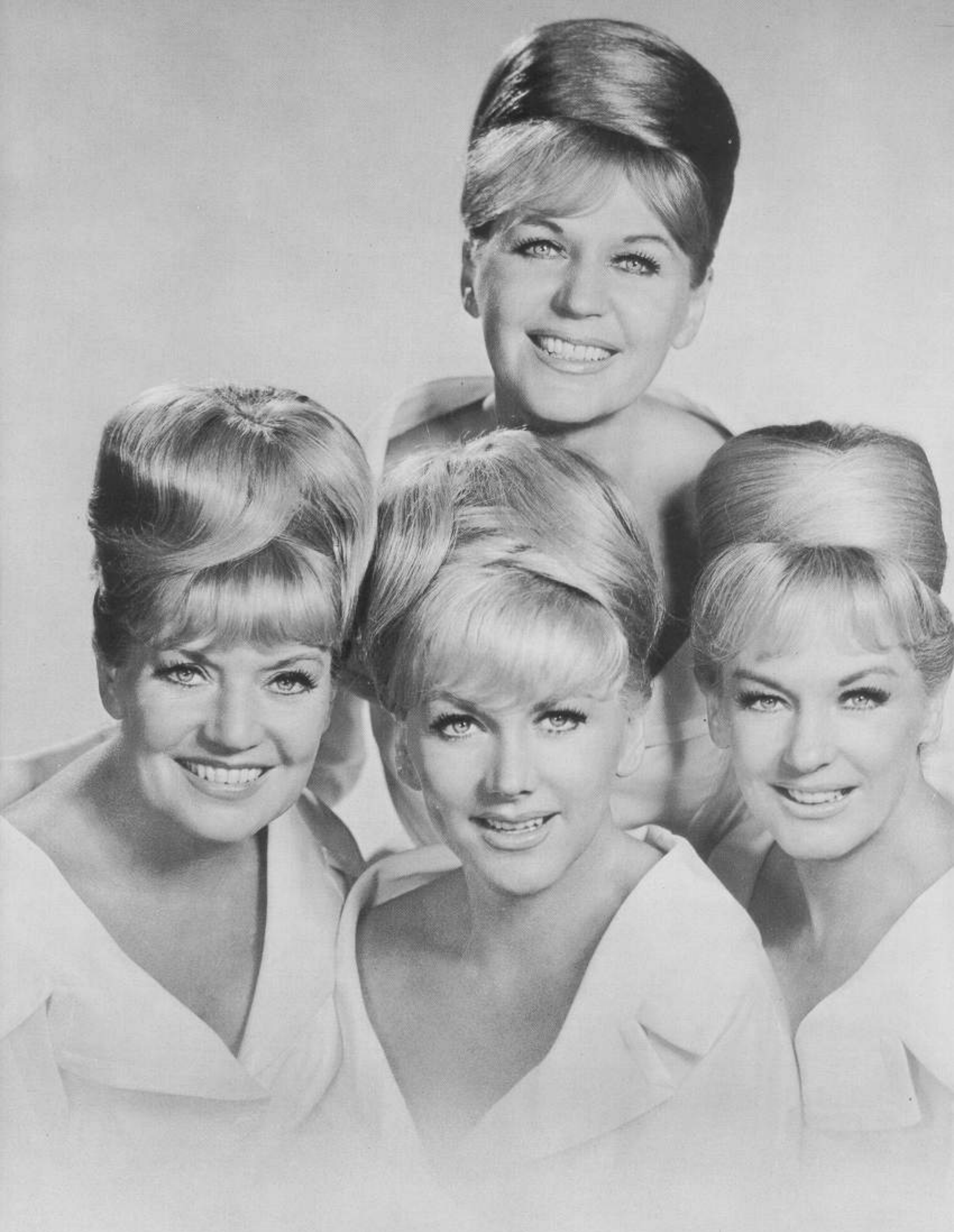
The King Sisters: Luise (top), Alyce, Marilyn and Yvonne.