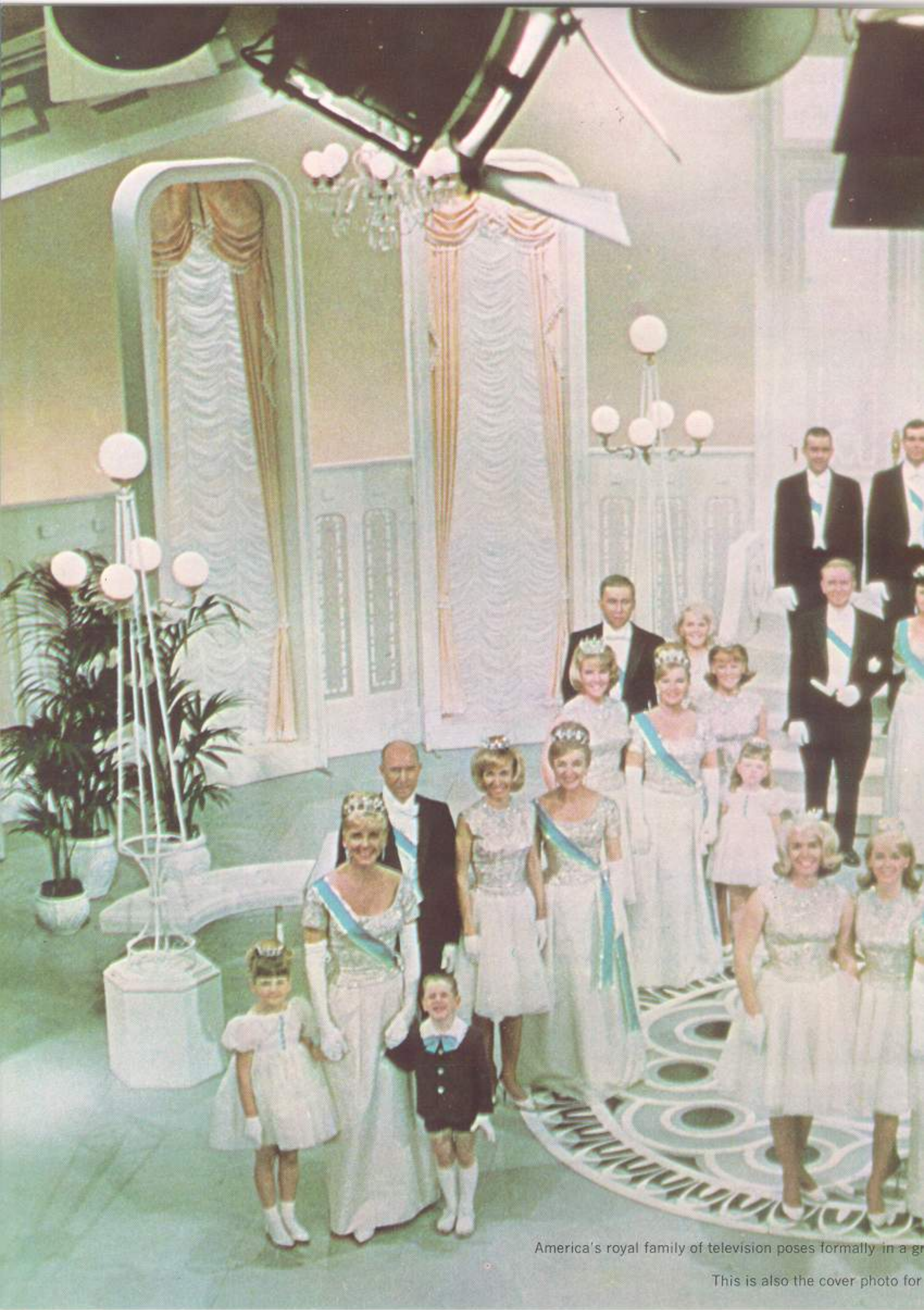
America's royal family of television poses formally in a gr