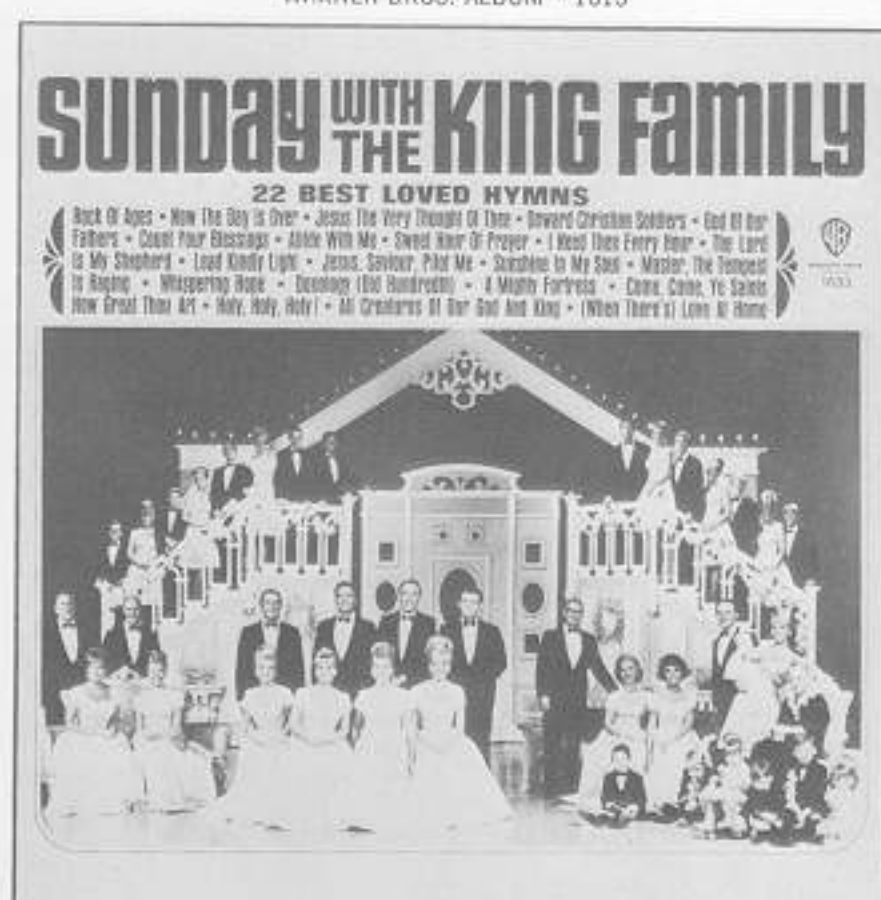
SUNDAY WITH THE KING FAMILY WARNER BROS. ALBUM #1633

NEW... 2 more! • THE NEW SOUNDS OF THE KING SISTERS • THE KING FAMILY LIVE in the Round