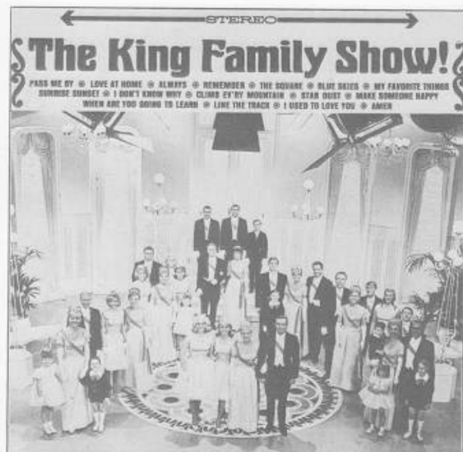
THE KING FAMILY SHOW! WARNER BROS. ALBUM #1601