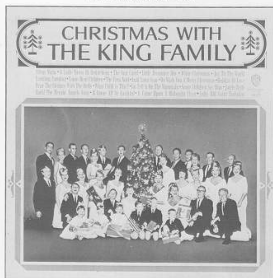
CHRISTMAS WITH THE KING FAMILY WARNER BROS. ALBUM #1627