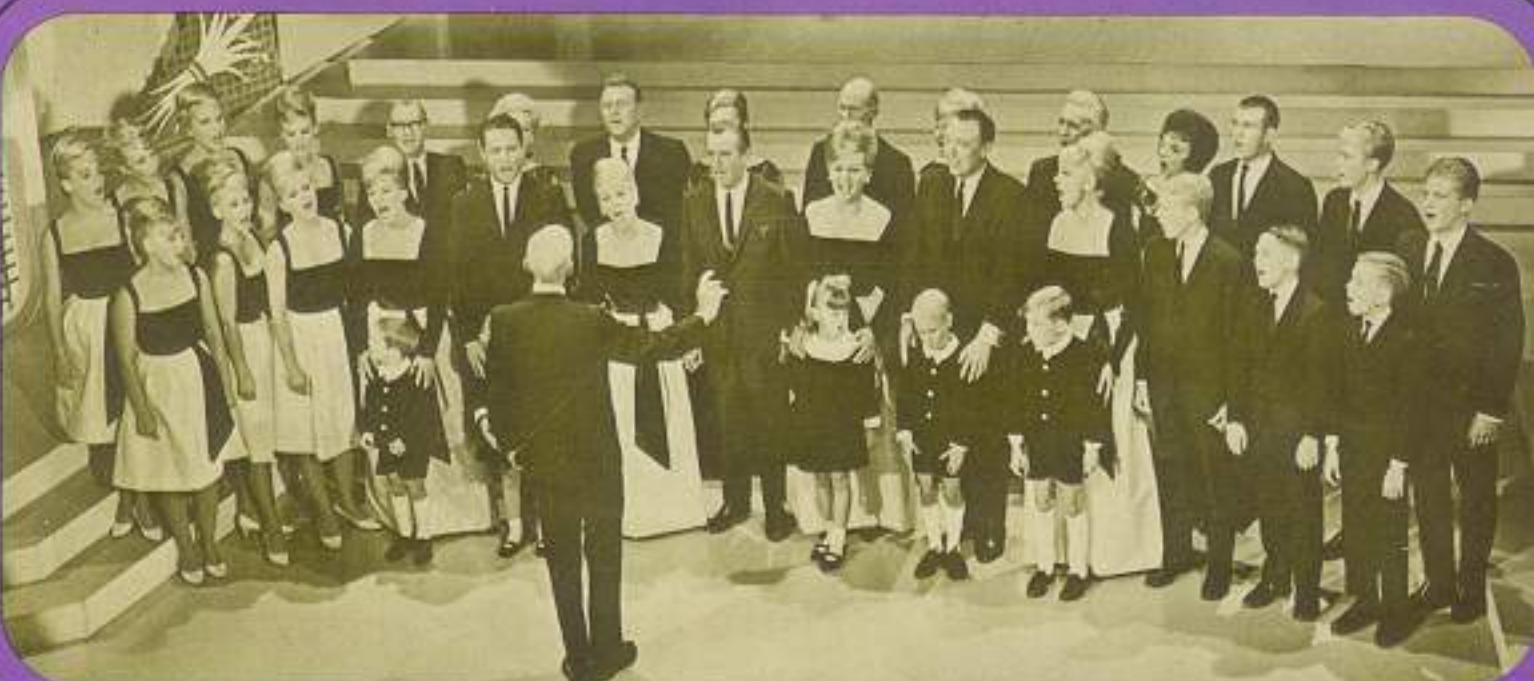
"There is beauty all around, when there's love at home."