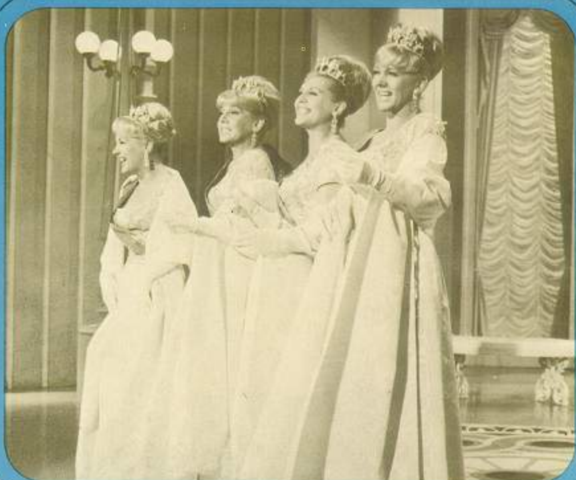
Four lovely Kings dressed like queens.