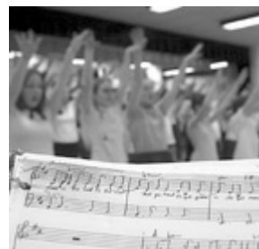
Members of the Tantasqua Junior High School Show Choir rehearse 'Grease' Thursday, March 21. Their first competition is this Saturday.

FOR COMPLETE STORY, PICK UP TODAY'S SOUTHBIDGE EVENING NEWS