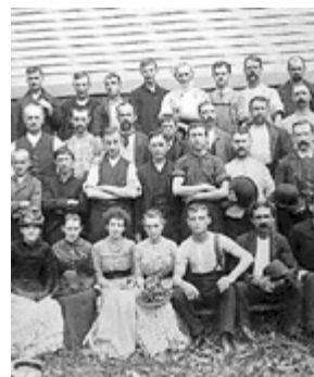
Employees of the American Optical Co. in 1890 gather in front of the main office.

FOR COMPLETE STORY, PICK UP TODAY'S SOUTHBIDGE EVENING NEWS